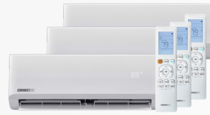
Indoor Units and Remotes